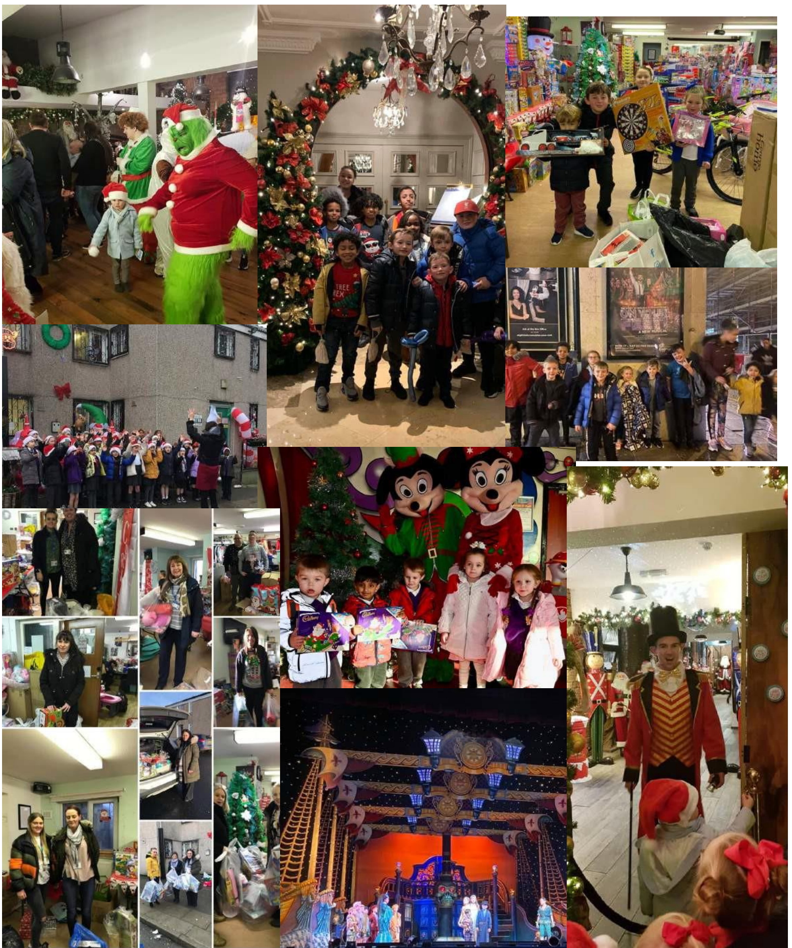
I had a boss time at Peter Pan pantomime and got a lovely doll from Father Christmas too